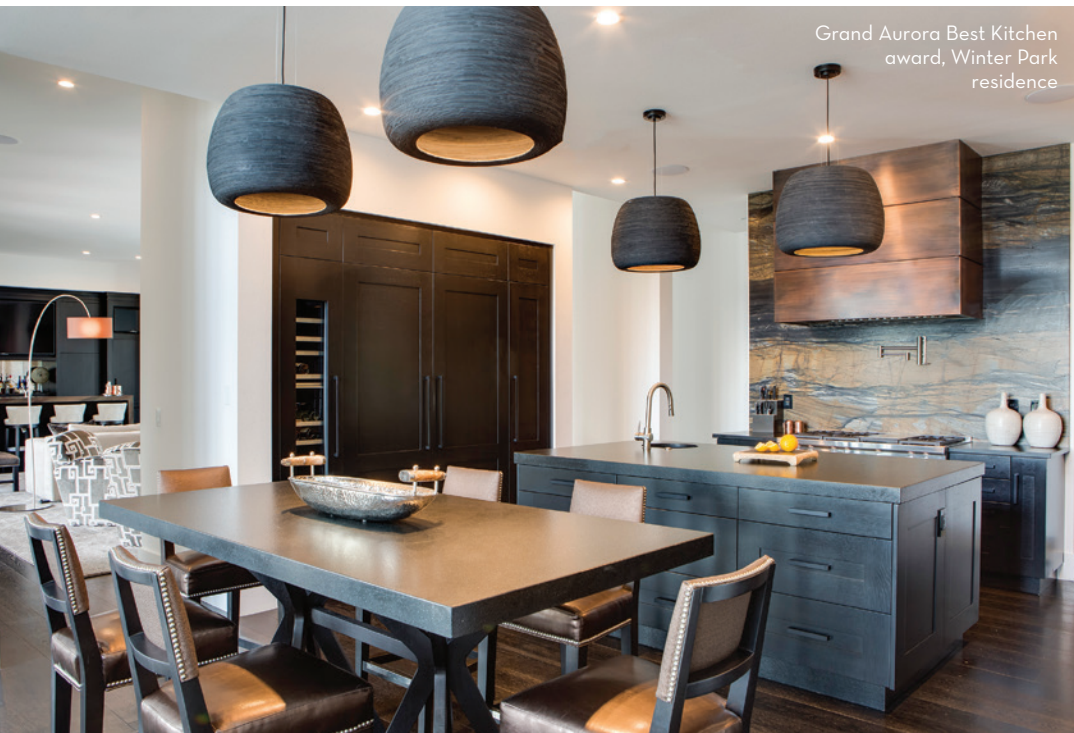
Grand Aurora Best Kitchen award, Winter Park residence