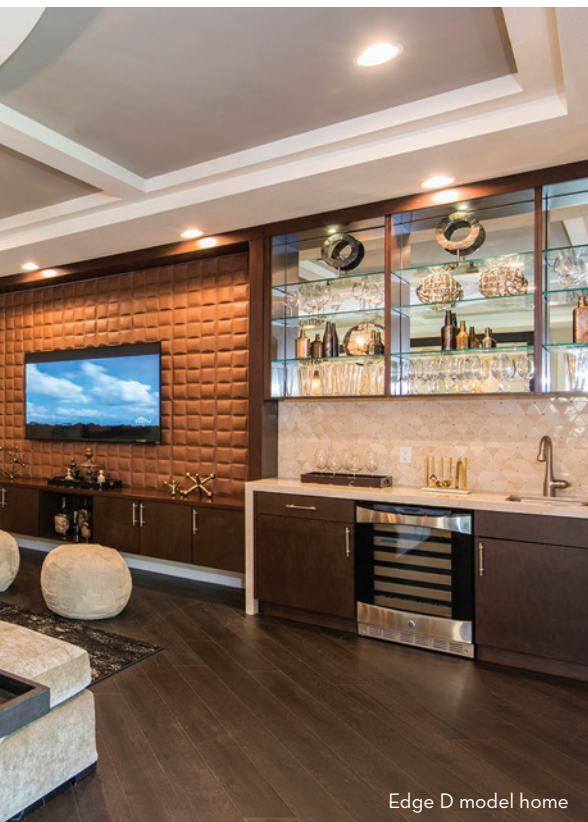
Edge D model home