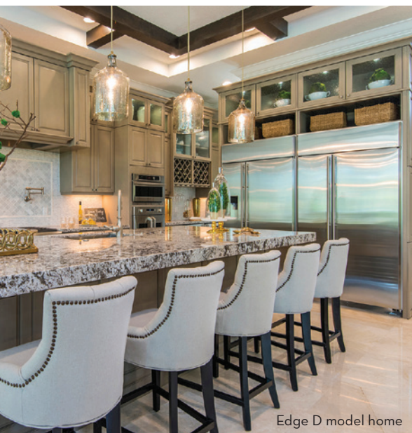
Edge D model home

Using a warm tone color palette instead of the ubiquitous white and gray, the design team created a contemporary twist on modern style using unique and sleek finishes in simple, clean, elegant forms. The fridge and freezer, clad in custom panels, showcase the commercial-grade range and hood while the thick concrete countertop further instills the “durability” of the space and wood-planked wall grounds the space.