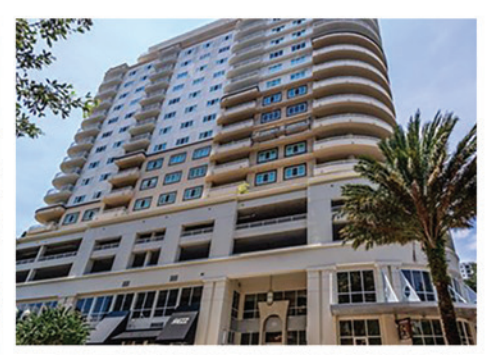
LUXURY LIVING IN THE SANCTUARY 5 BEAUTIFUL UNITS AVAILABLE

#1208: 2 bed, 2/bath,1,600... $435,000 #508: 2 bed, 2 bath, 1,600... $483,000 #909: 3 bed, 2.5 bath, 2,035... $599,000 #901: 2 bed, 2.5 bath, 2,120... $719,000 #1610: 3 bed, 2.5 bath, 2,475... $920,000