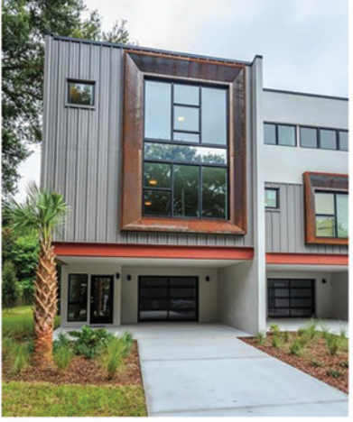
FRANCIS PARK LUXURY TOWNHOMES 3 story units boast airy & open floor plans with a modern kitchen Starting at $362,000

Call your Downtown Penthouse & High-rise expert, REALTOR Shelby Norwich.